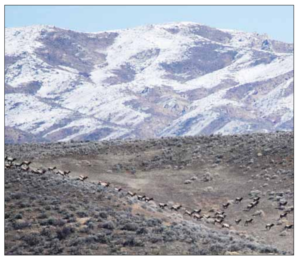
An opportunity to hunt elk every year is important to many hunters.