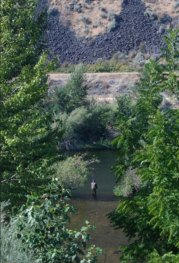
Nearly half of Fish and Game's revenue comes from license and tag sales, like from this angler.

So what about the species that aren't hunted or fished?