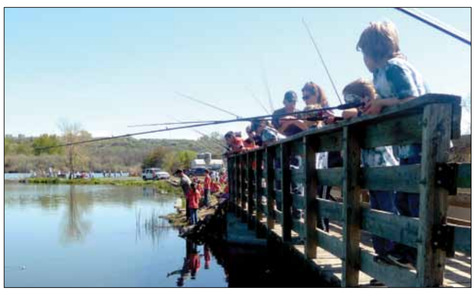
The Hagerman Wildlife Management Area draws anglers of all ages.

They range in size from the 82,000-acre Craig Mountain WMA to the 314-acre Red River WMA. Twenty one are