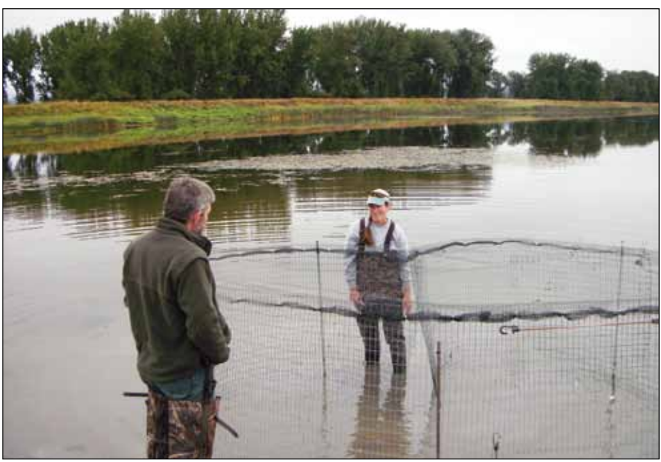
Trapping ducks on the Boundary Creek Wildlife Management Area.