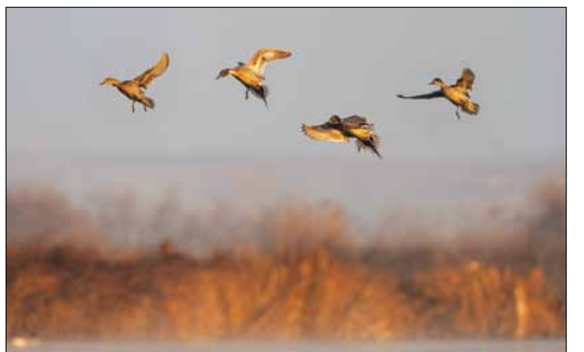
Pintails line up for a landing in an Idaho wetland.

Breeding duck population size and production are estimated annually during